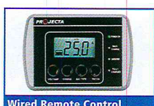
Wired Remote Control

Maintains a constant voltage on a battery making it ideal for vehicle diagnostics