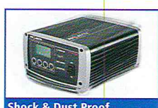
Shock & Dust Proof

Allows charger to be mounted out of sight yet retain total control (Details page 35)